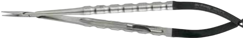
NHDPV Velvart Microsurgical Needle Holder, Diamond Dusted, 18cm For use with 6-0 to 8-0 sutures