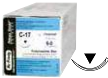
PSN8384P 6-0 Polypropylene, Blue, 18", C-17 3/8 Circle Needle