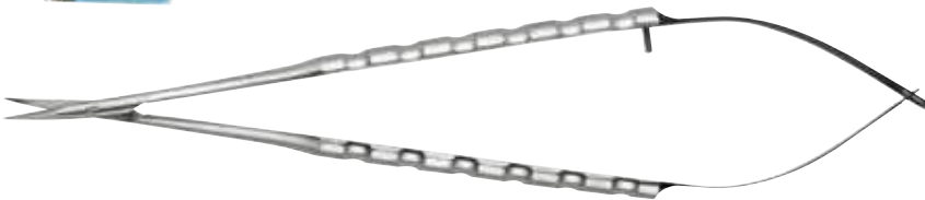
SPV Microsurgical Scissors