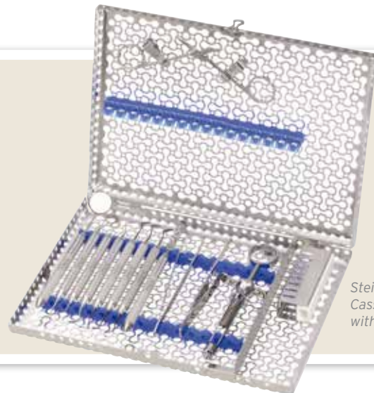
Steigmann Kit Cassette assembled with red rails.