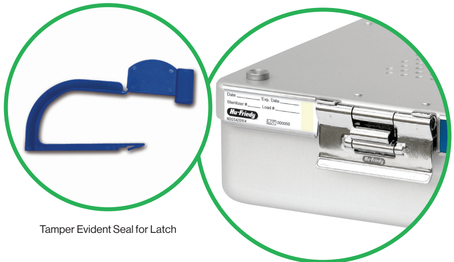
Tamper Evident Seal for Latch

Disposable Paper Filter 100 pieces, blank, single use