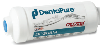
Municipal Cartridge DP365M

Empty the bottle, and place the empty bottle back on the manifold.