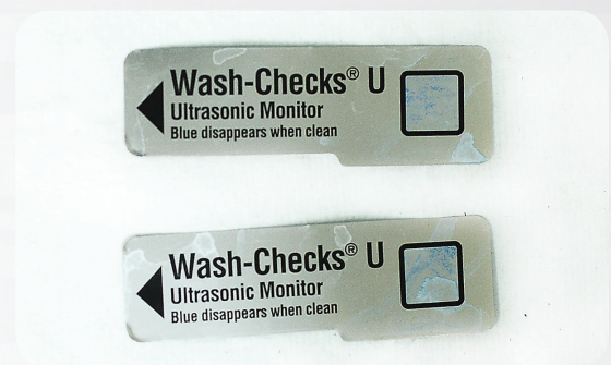
Figure 4. Residual blue test soil on Hu-Friedy Ultrasonic Cleaning Monitors after blood-soaked instruments were exposed for 1 minute in ultrasonic unit.

Cleaning of contaminated, reusable instruments prior to heat sterilization is a fundamental first step in all reprocessing procedures. If biological and soil contamination are not removed, remaining debris can interfere with microbial inactivation during a sterilization cycle. The present series of experiments studied a new generation of monitors which use a test soil that mimics bioburden. A successful cleaning process would be shown by removal of all soil from the commercial strip. When Hu-Friedy Ultrasonic Cleaning Monitors and Washer-Disinfector Cleaning Monitors were tested in an ultrasonic unit and instrument washer with heavily soiled instruments, respectively, both were able to meet or exceed visual observation findings. Test soil was completely removed during cleaning cycles designed to appropriately clean contaminated instruments; in addition, both monitors indicated failed cleaning when shortened or holding cycles were run. In summary, use of the Hu-Friedy Ultrasonic Cleaning Monitors and Washer-Disinfector Cleaning Monitors appeared to provide an effective method for assessing the effectiveness of ultrasonic and instrument washer cleaning processes.