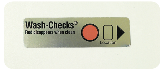
Figure 2. Unused Washer-Disinfector Cleaning Monitoring

In contrast to the above findings, when soiled instruments and Hu-Friedy Ultrasonic Cleaning Monitors were exposed to ultrasonic cleaning cycles of only 1-to-2 minute duration, multiple instruments were noted with remaining blood on them. While the number varied from cycle to cycle, at least 2-3 instruments in each load showed traces of blood. In addition, residual soil remained on Ultrasonic Cleaning Monitor test discs (Table 2; Figure 4). When the color was compared to the Cleaning Levels chart provided by Hu-Friedy , it was determined that only Level 2 or Level 3 cleaning performances had been achieved.