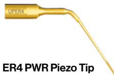
ER4 PWR Piezo Tip UPER4