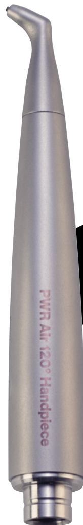
PWR Air 120° Handpiece APHP120