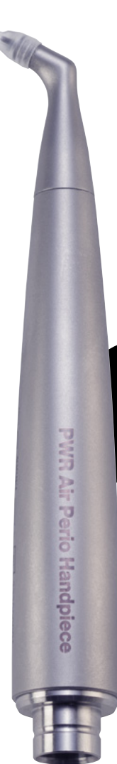
PWR Air Perio Handpiece APPPERIO