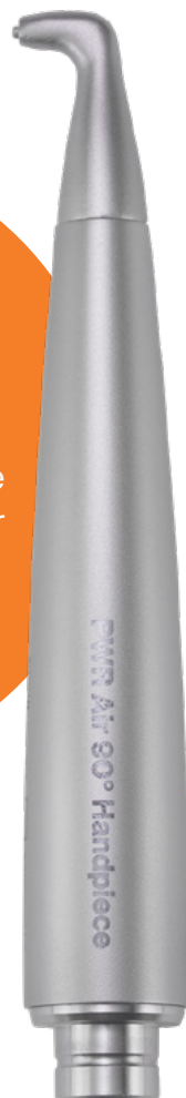
PWR Air 90° Handpiece APHP90