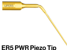
ER5 PWR Piezo Tip UPER5