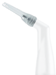
PWR Air Perio Subgingival Tips APPERIOTIPS QTY: 40

All PWR Air Polishing Handpieces are resilient to cracking, being made from steel. Practice with the power peace of mind: fewer interruptions and less time spent replacing handpieces.