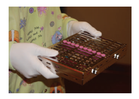
FIG. 2 — Contaminated instruments in a cassette to be cleaned and sterilized. This practice can greatly reduce the possibility of personnel having a sharps accident.

Use of acceptable containers to transport contaminated instruments safely to the sterilization area ensure that the working ends of instruments are not exposed, thereby preventing sharps injuries. Cassettes are specifically designed for this purpose, with instruments held securely and sharp tips contained within (Fig. 2).