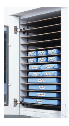
FIG. 3 — Sterilized, wrapped instruments in cassettes stored in cabinets.

The instrument processing and recirculation pathway involves multiple steps. Correct cleaning, packaging, sterilizer loading procedures, and storage practices are essential to ensure that an instrument is adequately processed and safe for reuse on patients. When traveling "first class" with instrument cas-