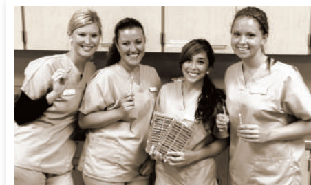
DELIVERY AND SUPPORT