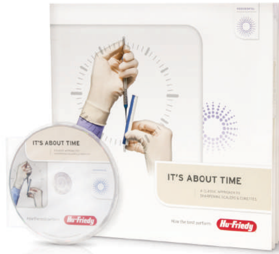
Sharpening Manual | SHM It's About Time to Get on the Cutting Edge Instrument Sharpening manual.