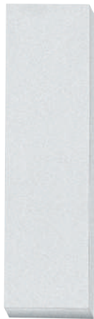
#4 Sharpening Stone | LSS4 3" x 11" x 7-1/2" (7.6 x 28 x 19 cm)