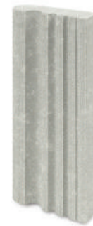
No.5 Arkansas Bates Hard Fine Grit o