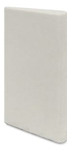
No.6A Arkansas Thick Wedge Hard, Fine Grit o

4-1/2" x 1-7/8" x 3/8" down to 1/8" (11.4 x 4.8 x .9 down to .3 cm)