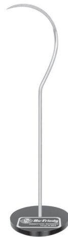
#H6 Sickle Scaler | LSMH6

All large scale models are also available in cross section