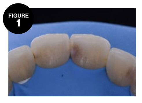
PREOPERATIVE VIEW: Class III lesions on teeth #8 and #9.