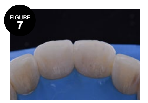
POSTOPERATIVE VIEW A beautifully and biomimetically-completed restoration.

It is customary to complete a restoration on one tooth before switching focus to another. The sheer thinness of the AKRO-FLEX blade allows for unimpeded proximal access to the restoration allowing one to sculpt proper form without touching the unrestored tooth.