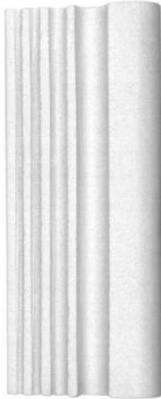
SS5 Bates Arkansas Stone

Always sharpen the back of the blade (shiny surface) using a fine or hard sharpening stone. A Bates Arkansas Stone (SS5) has grooves which conform to the shape of the blade. To sharpen, pull the back of the blade through the narrowest groove.