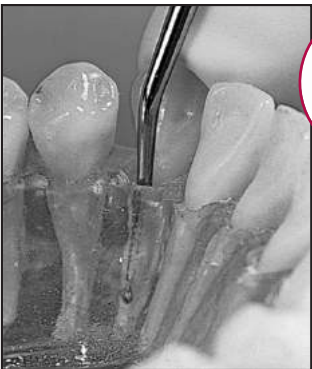
Extended 7/8 in anterior periodontal pocket