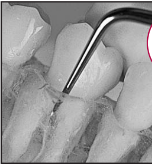
1/2 Debridement Curette