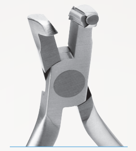
678-111 Flush Cut & Hold Distal End Cutter