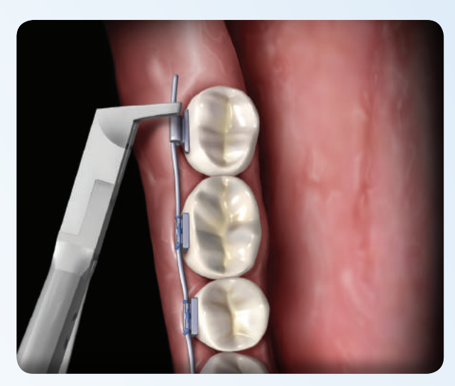
Occlusal view of the Slim Flush Cut & Hold Distal End Cutter cutting the archwire flush to the buccal tube.